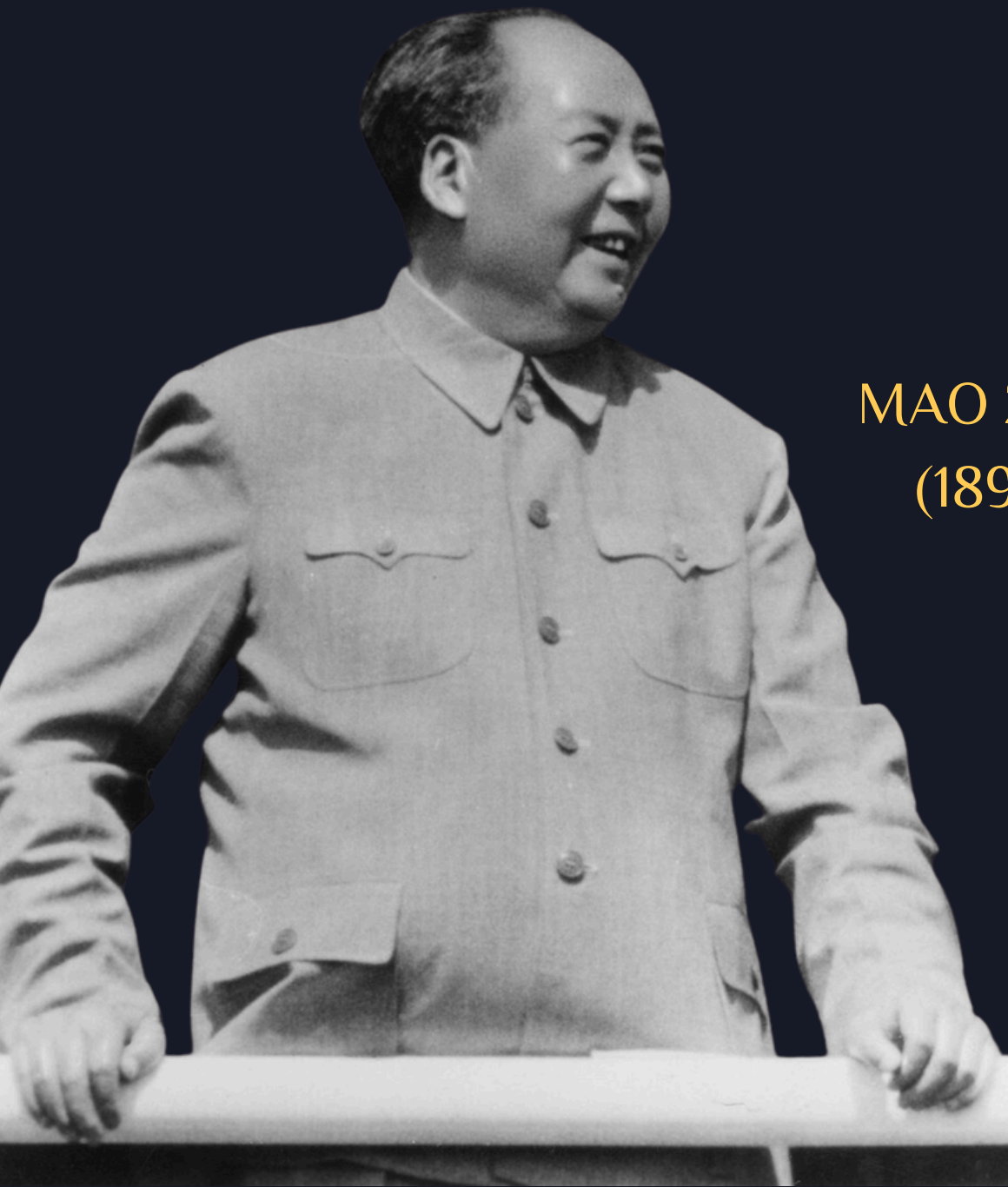
MAO ZEDONG (1893-1976)