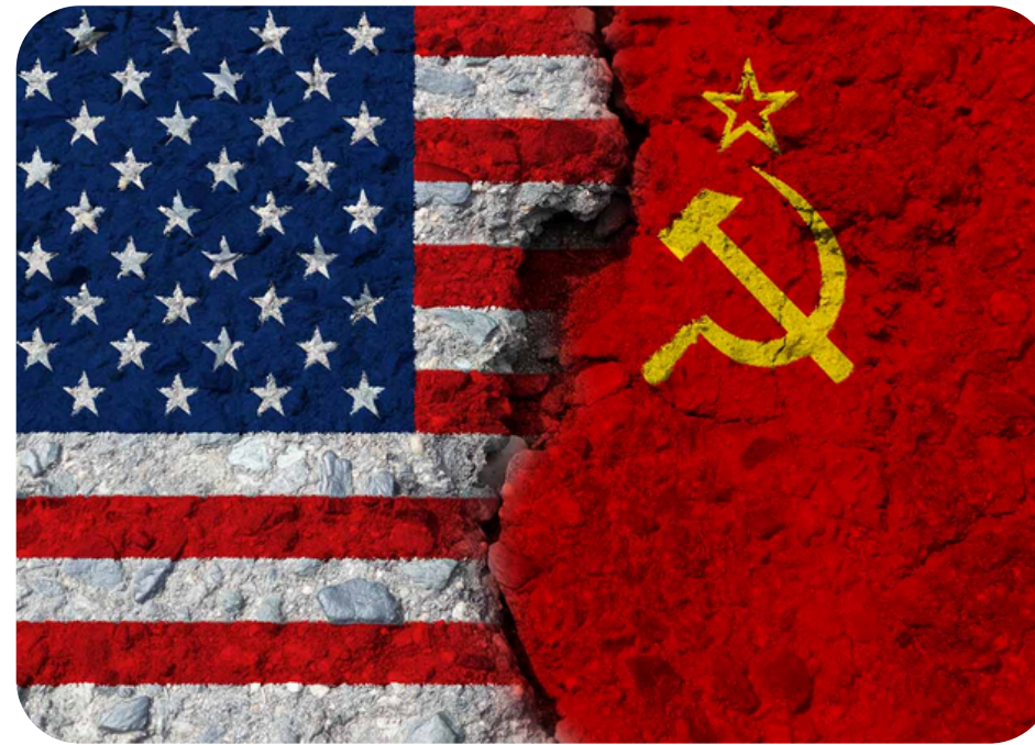
Formation of blocs and the intensification of the Cold War