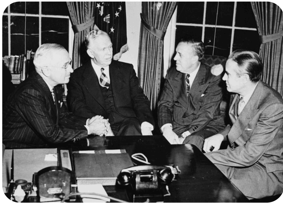
The Marshall Plan and European Reconstruction