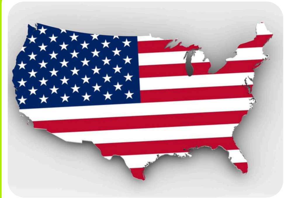
An enduring model for American foreign policy