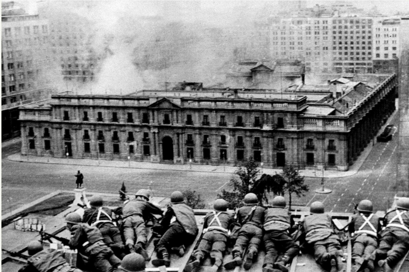
Moneda Palace attacked on September, 11th 1973