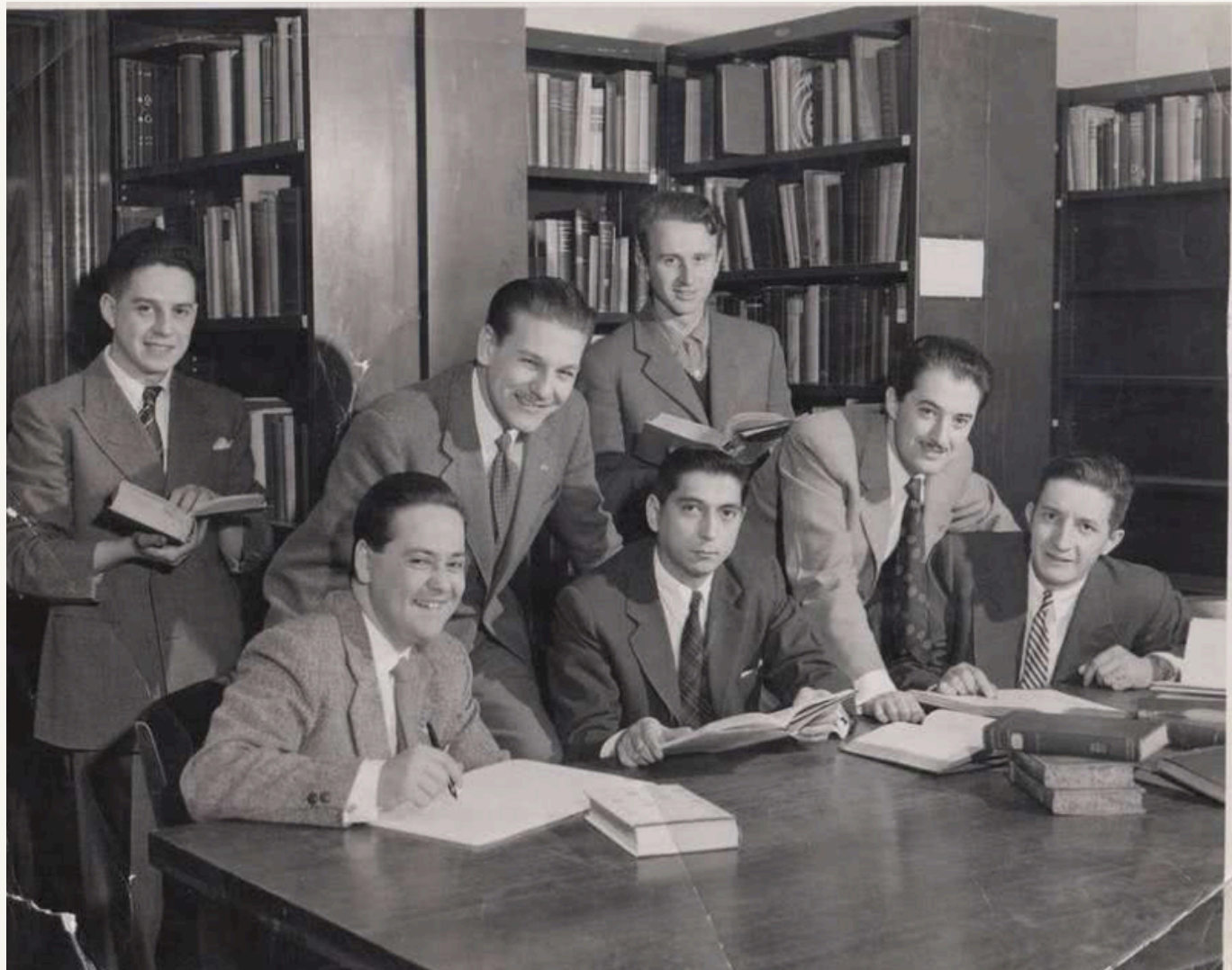
The Chicago Boys