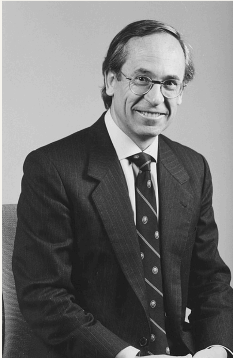
José Piñera, Minister of Labour