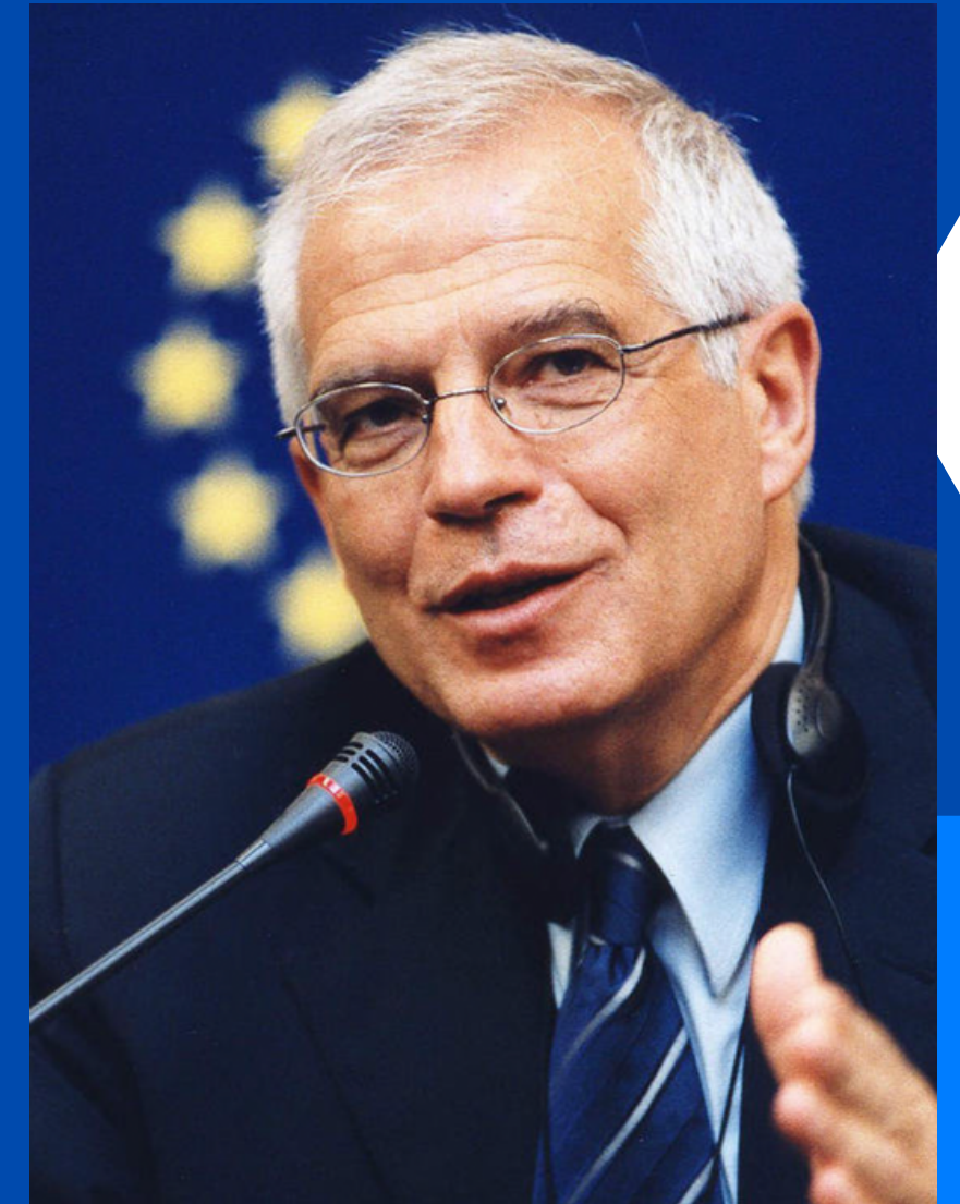
Josep Borrell Fontelles

The High Representative of the Union for Foreign Affairs and Security Policy