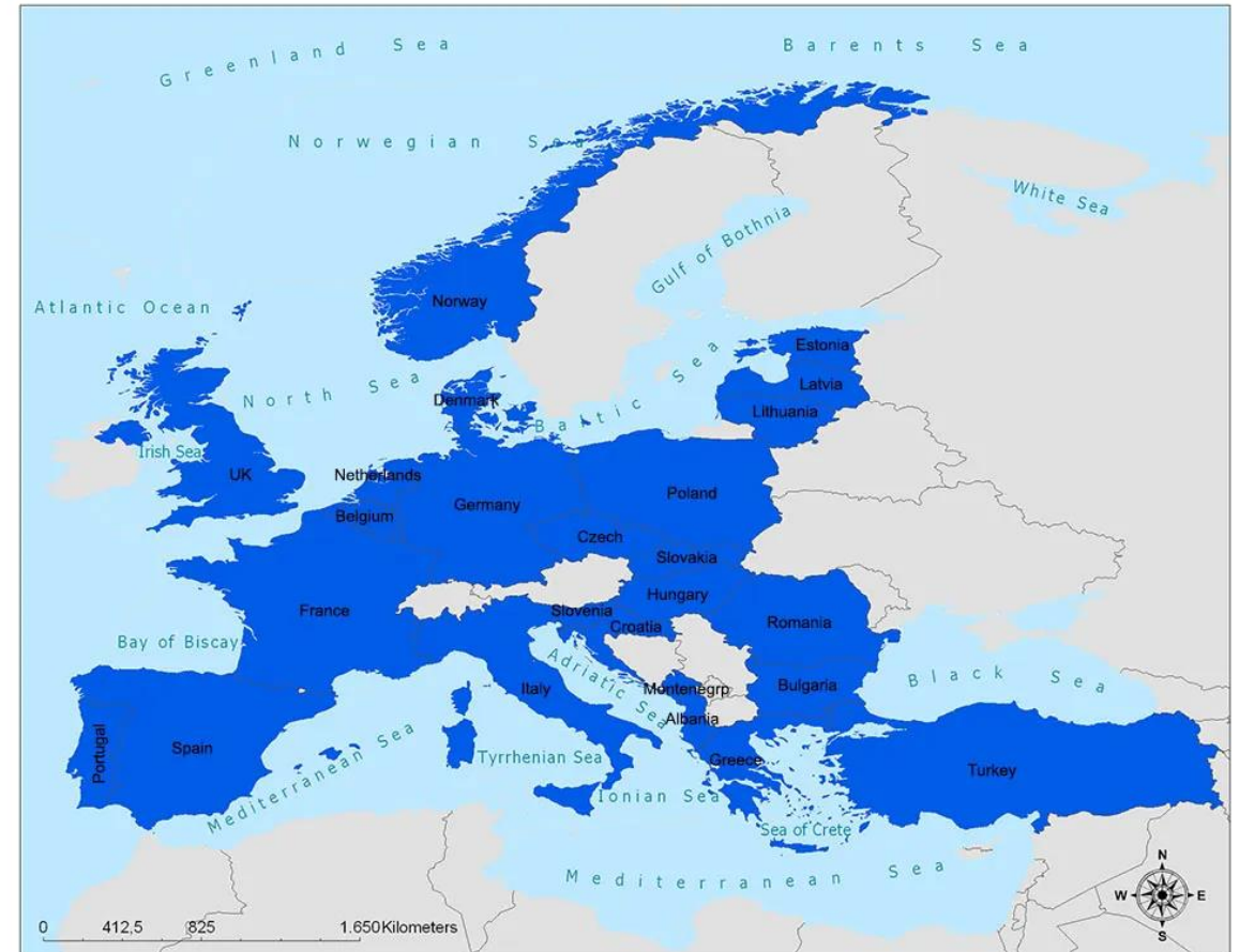
NATO MEMBERS IN EUROPE